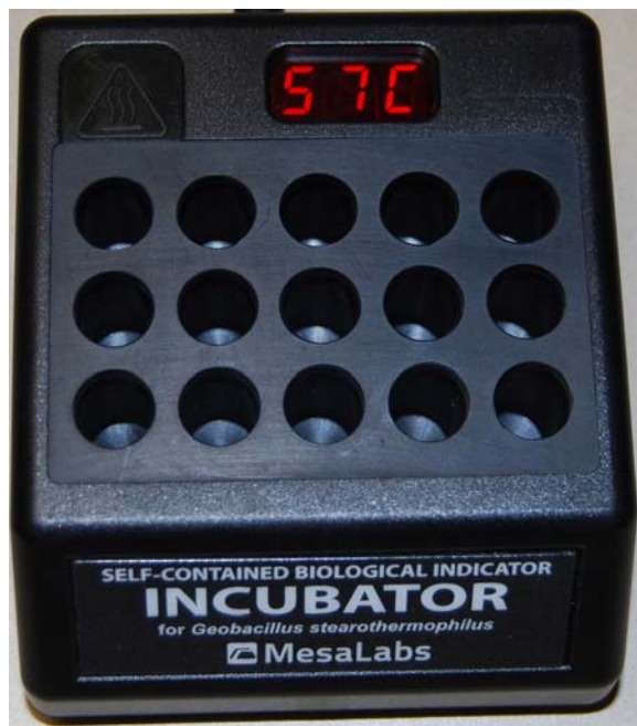
Figure 2 – Top of Incubator

Dispose of positive or negative BIs immediately per the instructions for use that accompany each box of indicators, or per your organization's policy.