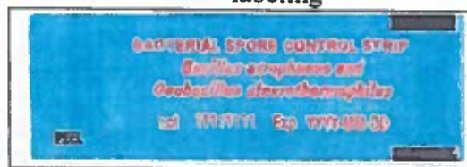
Spore Strip Combined - Control primary labeling

As always, if you have any questions, please contact your Mesa Laboratories Representative.